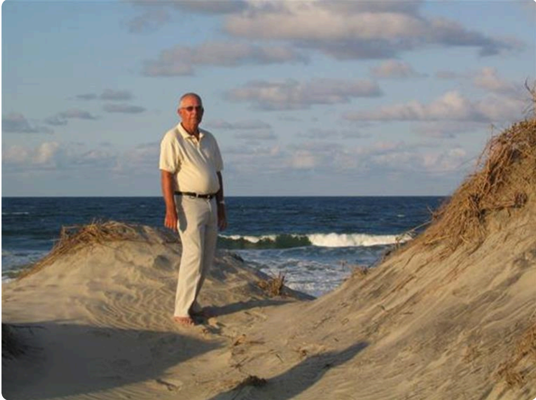
Dad at NC Outer Banks in 2005.